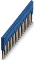
Plug-in bridge, pitch: 5.2 mm, number of positions: 20, color: blue

Please be informed that the data shown in this PDF Document is generated from our Online Catalog. Please find the complete data in the user's documentation. Our General Terms of Use for Downloads are valid ( http://phoenixcontact.com/download )